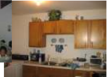
↑ BEFORE ↑