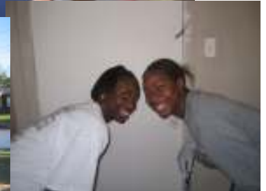
↑ DURING ↑